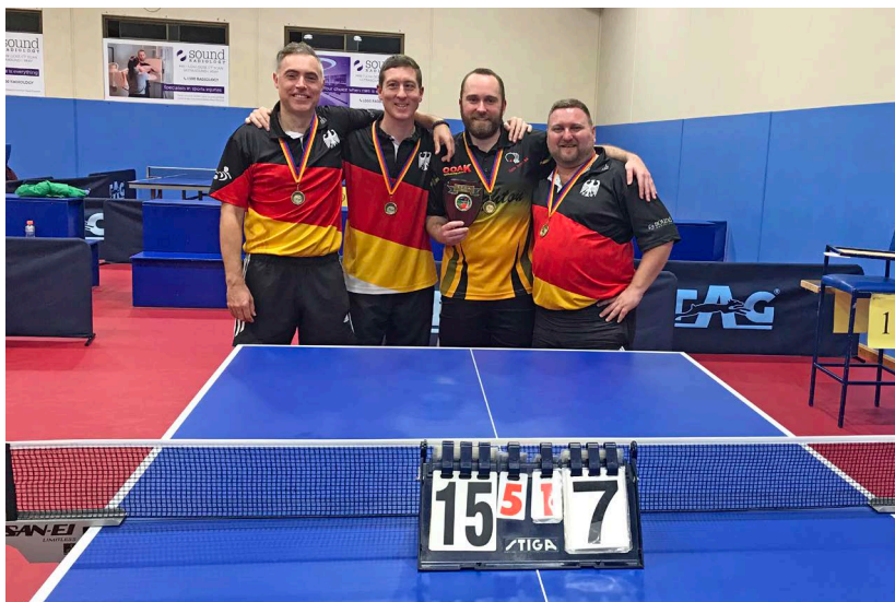
TABLE TENNIS SOUTH AUSTRALIA (TTSA) WINTER PENNANT TEAMS

2019 Winter Pennant Division 2 Team Competition Winners – a great result!