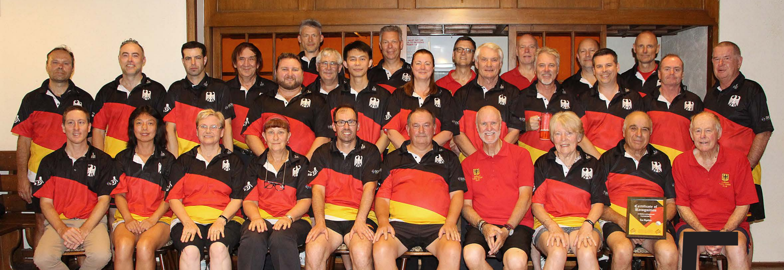
Annual club photo.