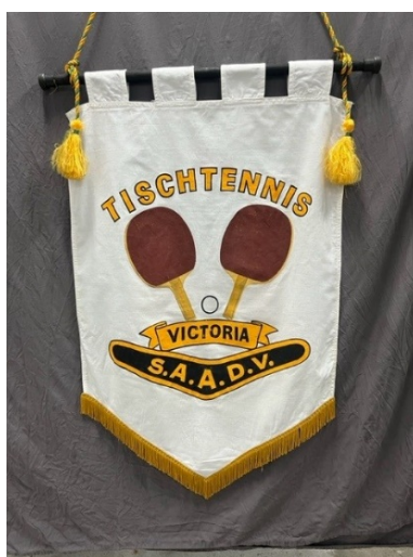
Original Club Flag