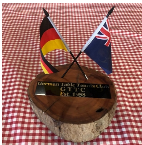
Stammtisch Table Sign