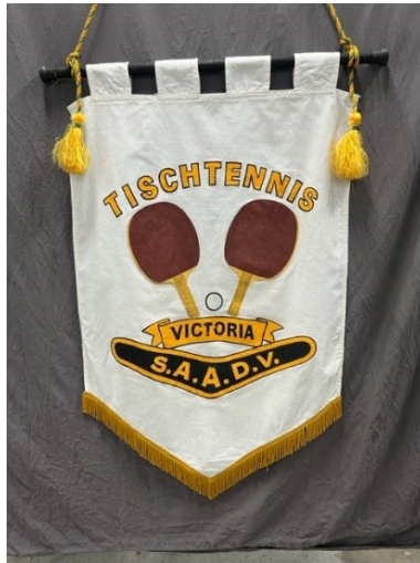
Original Club Flag