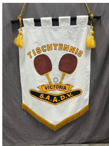
Original Club Flag