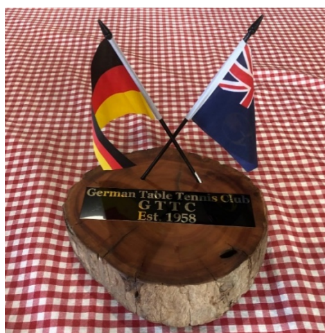
Stammtisch Table Sign